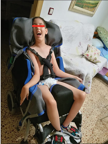
Figure 2: Clinical photograph of the patient.

Other studies focus on TH analogs that use alternative transporters to substitute this genetic deficit. [7] 3,5-diiodothyropropionic acid was tested in a pilot study with four children, improving biochemical abnormalities. [8] TRIAC also showed improvement in the clinical manifestations of thyrotoxicosis. [9] The main biochemical effect was the reduction of T3 with TSH suppression and, therefore, a decrease in the synthesis and secretion of TH. This improves hypermetabolism and its consequences. However, only slight improvement in terms of intellectual disability was observed in children under 3 years. In older children, there was no improvement. [2,7,9] Treatment with intrathecal TRIAC was also tested in mice. Although brain T3 availability increased, the results were not satisfactory. [10]