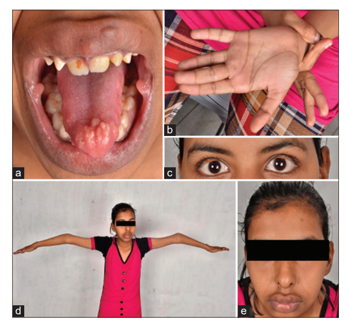
Figure 1: (a) Nodular swellings over the lips, buccal mucosa, and tongue. (b) Demonstration of wrist sign in the same child. (c) Bilateral ectropion and nodular swellings in bilateral upper eyelids. (d) Marfanoid habitus with arm span longer than length. (e) Another image of nodular swellings on both the lips.

A 15-year-old girl presented with multiple nodular swellings over the tongue, lips, angle of the mouth, and bilateral upper eyelids. She was comparatively tall (height 160 cm, +0.6 Z) when compared to her mid-parental height (146 cm, -2.12 Z) and had a marfanoid habitus with bilateral ectropion on examination [Figure 1]. Due to the clinical phenotype and suspicion of the polyendocrine syndrome, investigations for medullary carcinoma thyroid (MTC) were done which showed high serum calcitonin 956 pg/mL (normal range < 10 pg/mL). Ultrasound thyroid revealed two intrathyroidal lesions with calcification [Figure 2] and biopsy of the lesion confirmed the diagnosis of MTC. The clinical features and lab abnormalities established the diagnosis of multiple endocrine neoplasia type 2B (MEN2B). MEN2B is a polyendocrine syndrome caused by activating mutations in the RET proto-oncogene and is characterized by MTC (100% cases), pheochromocytoma (50%), and a classic clinical phenotype which