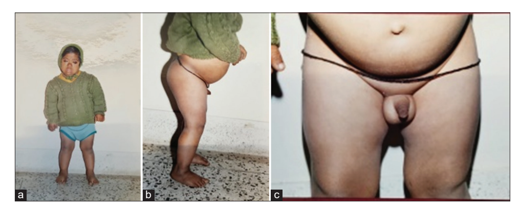
Figure 1: 8-year-old boy with Down syndrome with primary hypothyroidism - pre-treatment: (a) Frontal view, (b) Bulky muscles, (c) Enlarged testes.

An 8-year-old child, karyotype confirmed case of Down syndrome, was referred for evaluation of lethargy and sleepiness. The child had clinical stigmata of Down syndrome. He was short (weight Z-score -2.58 and height Z-score -3.74). He had coarse facies with a depressed nasal bridge, a large tongue, dry skin, and a dull expression. His voice was hoarse. His movements were slow. The clinical picture was consistent with severe hypothyroidism. Muscles were bulky, particularly the calf muscles and thigh muscles, and firm on palpation [Figure 1a]. He had difficulty getting up from the floor with slowness of movements. He was unable to stand straight and kept his knees and hips partially flexed [Figure 1b]. He also had difficulty lifting his arms above head. His testes appeared to be large. His Tanner SMR staging was G2P1A1, testes were