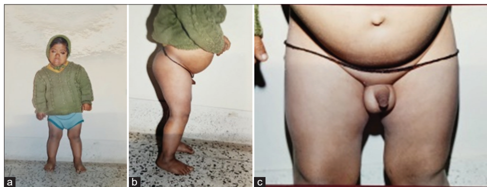
Figure 1: 8-year-old boy with Down syndrome with primary hypothyroidism - pre-treatment: (a) Frontal view, (b) Bulky muscles, (c) Enlarged testes.